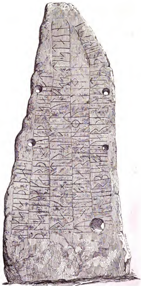
TRYGGEVÆLDE, SEALAND. (A).