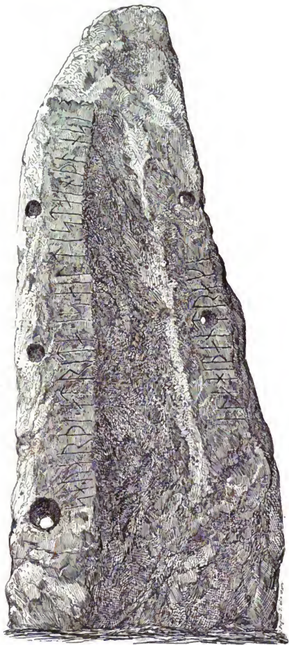
TRYGGEVÆLDE, SEALAND. (B).